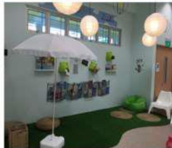
Nascans @ East Spring