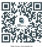
WGPS PSG Application form

The PSG provides support for school activities, enhancing student welfare and growth. It serves as a key communication channel for parents to offer constructive feedback on school policies and programs. Additionally, the PSG actively recruits and leads parents, ensuring the sustainability of our vital home-school partnership. Together, let's foster a collaborative environment that propels the overall development of our students.